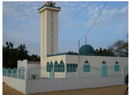
Mosque in Senegal built through migrant remittances.