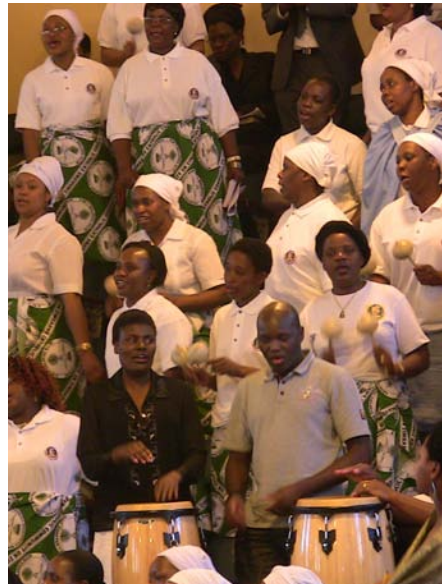
Congress of Zimbabwean Catholics, Birmingham, UK.

The course combines policy and theoretical debates over migration in the world today. It provides an ideal foundation for PhD research, or for those wishing to work with migrants and asylum seekers, aspiring to posts in UN, EU, national policy think-tanks, NGOs and grassroots organizations. The MSc is also suitable for professionals who would like to take time out to reflect on developments in a fast-moving field.